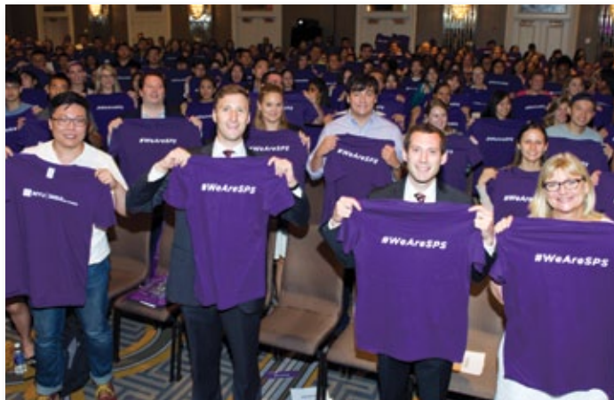
Students showed their school spirit during Graduate Orientation on August 31.

Students are getting the message out with a video that was specially created for Orientation and the initiation of Spirit Week. Take a look! bit.ly/WeAreSPS