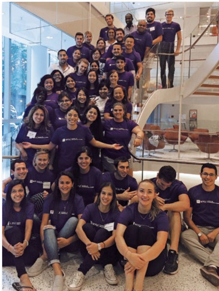
Undergraduate and Graduate Student Council and club leaders participated in a leadership training session in September to prepare for the new year.

MS candidate in Global Affairs, Center for Global Affairs