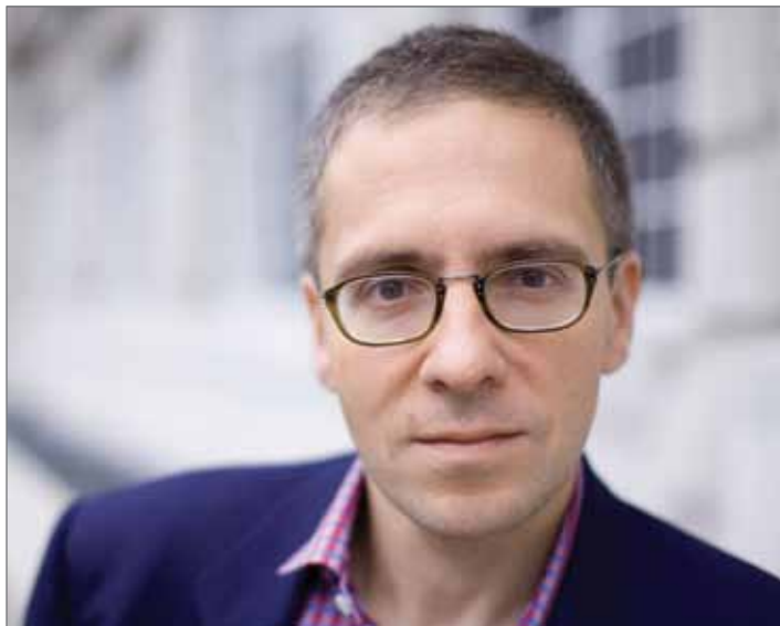
Ian Bremmer, president of Eurasia Group and expert on global macro political trends and emerging markets.